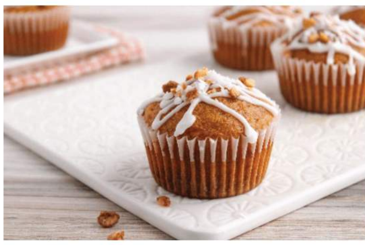
Glazed Pumpkin Spice Muffins