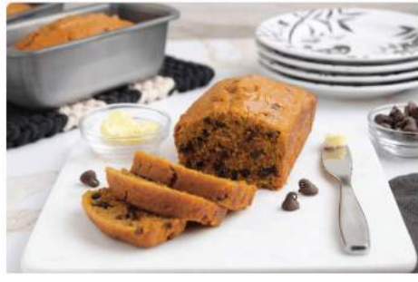
Pumpkin Chocolate Chip Loaf