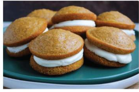
Pumpkin Whoopie Pies

Download your FREE Kids Coloring Page for Fall