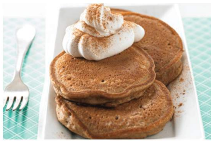
Pumpkin Spice Pancakes