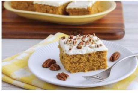
Pumpkin Spice Cake